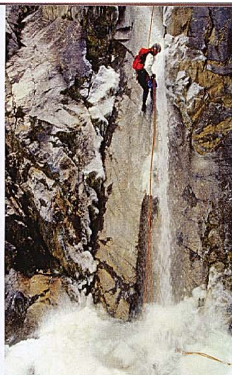
ABOVE Urban climbing, Italy ABOVE RIGHT Canyoning around Mont Blanc BELOW Ice climbing on Monte Bianco (Mont Blanc)